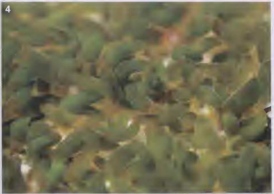
Figure 2. Aggregations of Wulguru cuspidata appear as dark sprinklings in wave-formed sand ripples on the clean quartz sand at mid-tidal level. Buffalo Creek, Shoal Bay, 23 December 2014. (Megan Hoskins) ◀